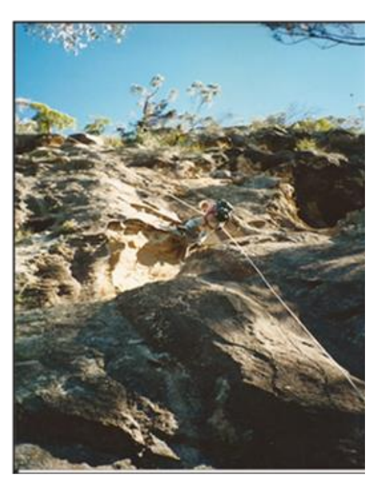
The Author on 50 mtr cliff-face, Binna Burra, Qld

There's nothing quite like going over the edge of a cliff! One moment you are standing vertically on a level piece of ground, with a spectacular view below you, but the next you are horizontal and the cliff is vertical! Your whole orientation has changed. As you approach the edge of the cliff you lean back, and slowly readjust your body orientation to a new plane.