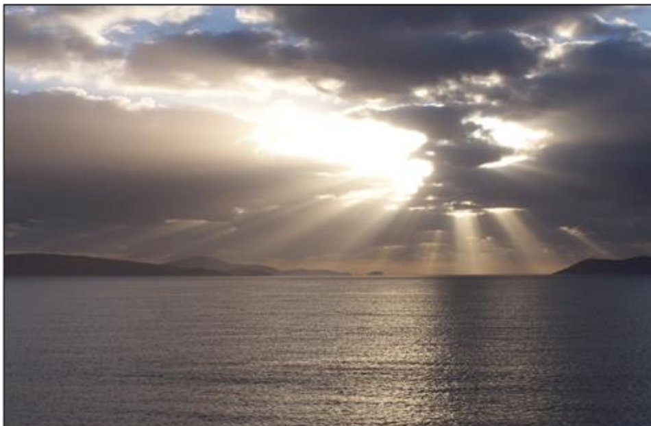
[Morning breaks over Middleton Beach, Albany, WA.]