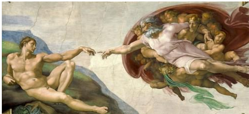
The reaching of hands between Adam and God, by Michelangelo

Jesus says that God is spirit. John 4:24, "God is spirit, and those who worship him must worship in spirit and truth." In other words, he's not physical. He's not material. He does not have a body as we know it.